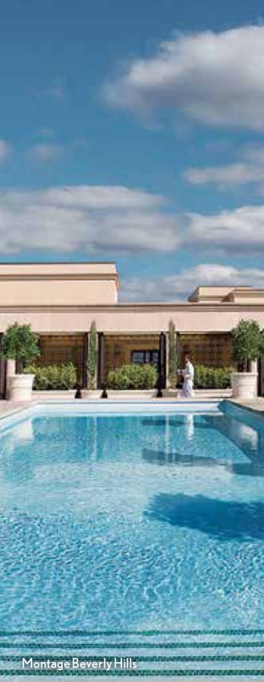
Montage Beverly Hills