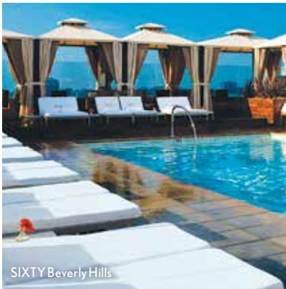
SIXTY Beverly Hills

Hotel Beverly Terrace's 39 guestrooms are appointed with custom designed furniture and artwork. This property offers an intimate setting and panoramic views of the Hollywood hills atop their rooftop terrace.