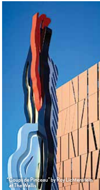
"Coups de Pinceau" by Roy Lichtenstein at The Wallis

• Rodeo Drive Walk of Style® – Introduced in 2003, the Walk of Style honors style legends for their contributions to the worlds of fashion and entertainment. Rodeo Drive Walk of Style® inductees receive a lasting tribute with permanent plaques featuring their signatures, which are embedded into the sidewalks along Rodeo Drive. Recipients of the Rodeo Drive Walk of Style Award include Giorgio Armani, Manolo Blahnik, Burberry and supermodel Iman.