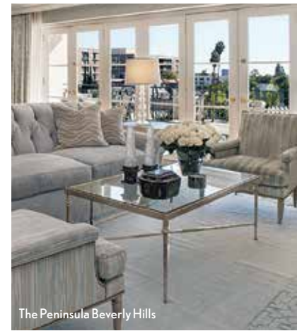
The Peninsula Beverly Hills

As the luxury brand's first west-coast build, Waldorf Astoria Beverly Hills features 119 deluxe rooms and 51 suites, offering unrivalled views in every direction. The five-star hotel will feature luxurious accommodations, amenities, unique anticipatory service and exclusive dining options by Michelin-star rated chef Jean-Georges Vongerichten. Opens early 2017.