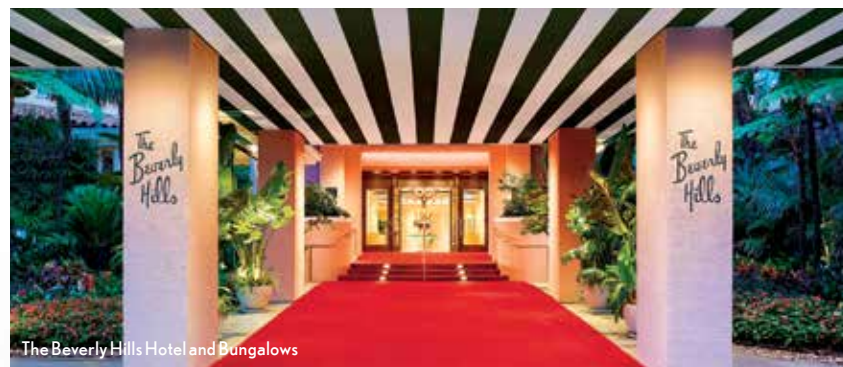
The Beverly Hills Hotel and Bungalows

Beverly Wilshire, A Four Seasons Hotel is in the heart of Beverly Hills and has the largest number of suites in Los Angeles, 137 in all, with a total of 395 rooms and suites. Here, guests may enjoy the same world-class service that has catered to Hollywood celebrities and international elite - from Elvis Presley, John Lennon and Warren Beatty to the British Royal Family.