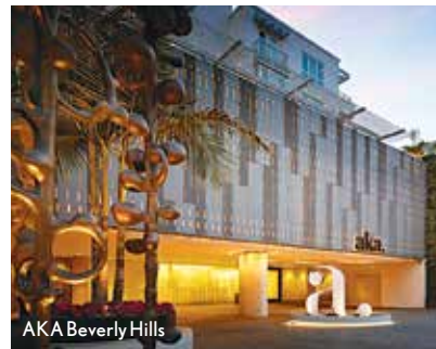
AKA Beverly Hills

AKA Beverly Hills is the ideal choice for those seeking luxury accommodations for seven nights or longer. It is an exclusive, contemporary residential oasis offering 88 spacious one- and two-bedroom furnished residences and spectacular bi-level townhouses. Gourmet kitchens, custom furnishings, outstanding residential amenities and attentive, personalized service are hallmarks of AKA.