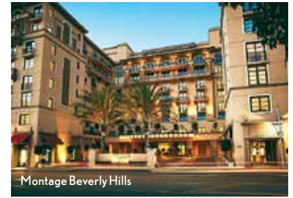
Montage Beverly Hills

A short walk from Rodeo Drive, SIXTY Beverly Hills is home to 107 sophisticated rooms with sleek modern furnishings and a rooftop pool offering panoramic city views.