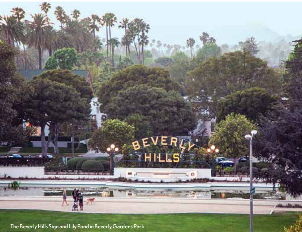
The Beverly Hills Sign and Lily Pond in Beverly Gardens Park

For more tips and information on what to see and do, visit LoveBeverlyHills.com/things-to-do .