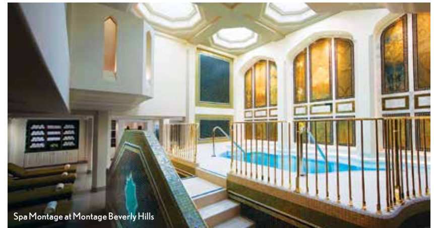
Spa Montage at Montage Beverly Hills

Refer to LoveBeverlyHills.com/things-to-do for a full list of spa, beauty and fitness options in the city.