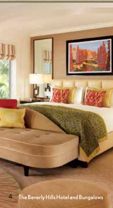
4 The Beverly Hills Hotel and Bungalows