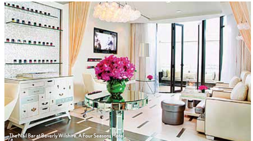
The Nail Bar at Beverly Wilshire, A Four Seasons Hotel