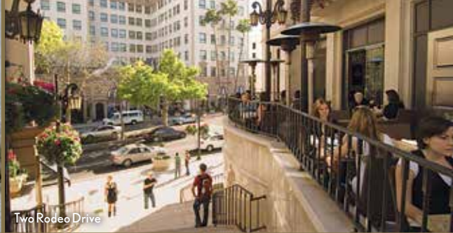
Rodeo Drive Walk of Style®