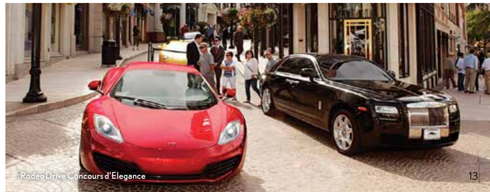
Rodeo Drive Concours d'Elegance