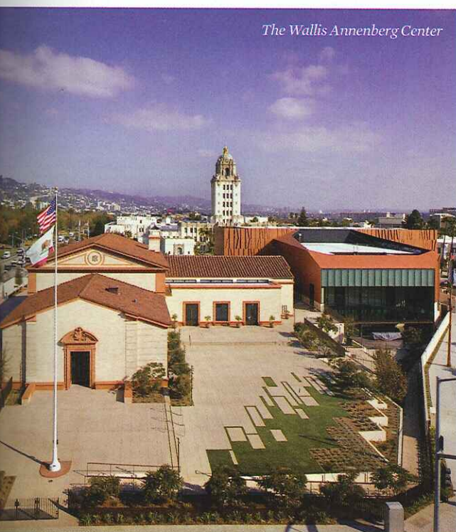
The Wallis Annenberg Center