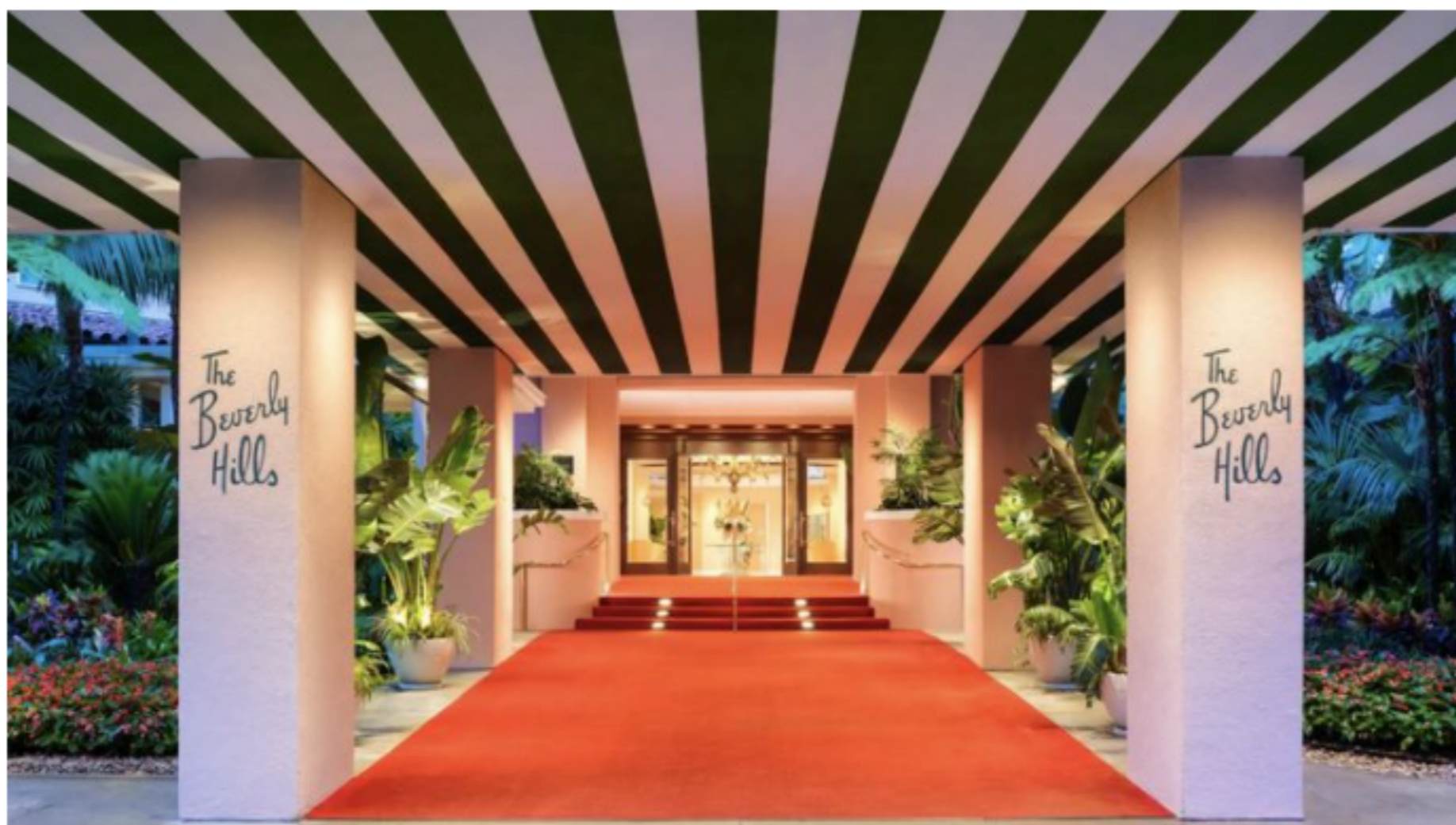
A view of the iconic entryway at the Beverly Hills Hotel.