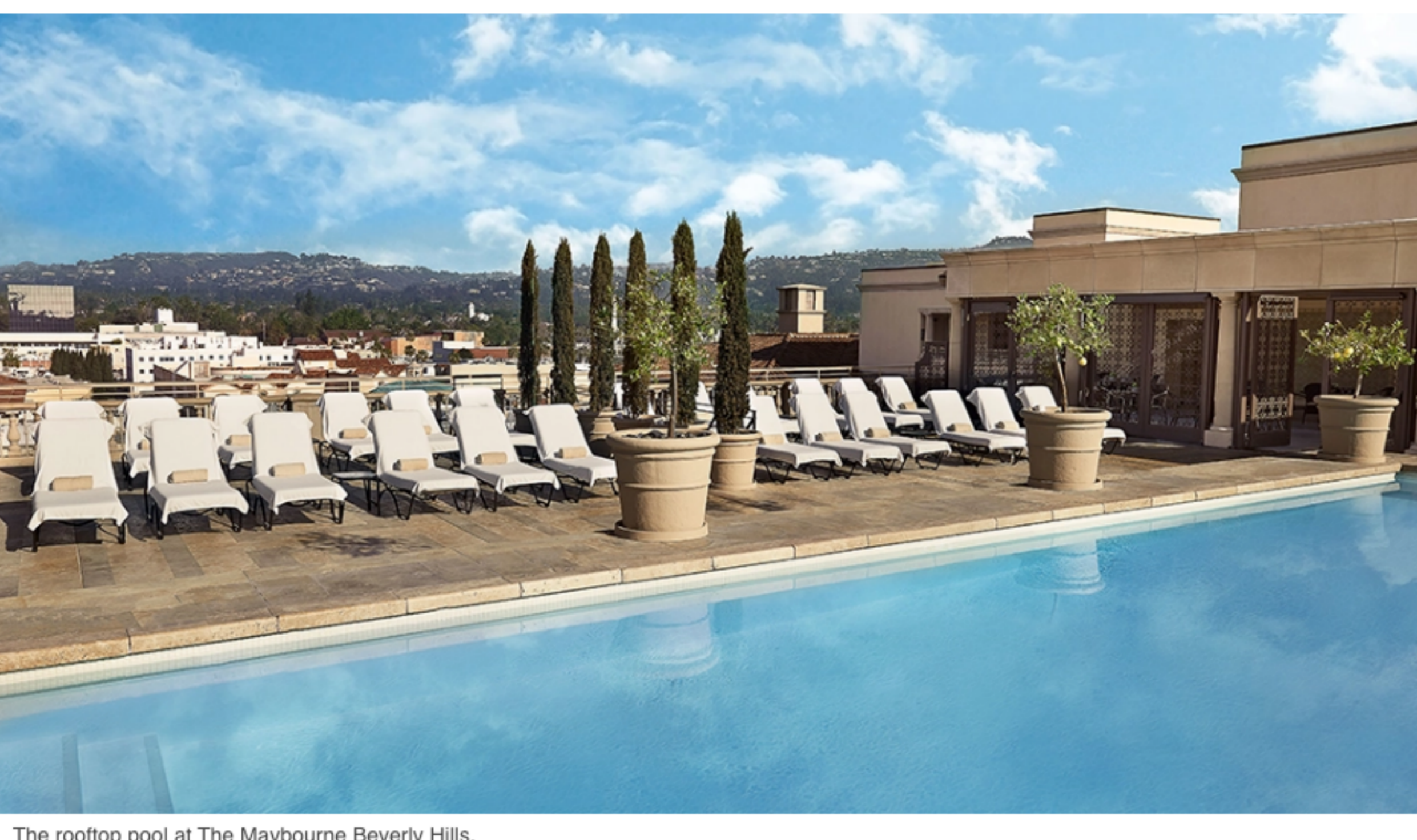
The rooftop pool at The Maybourne Beverly Hills. The Maybourne Beverly Hills

Beverly Hills is home to several legendary and luxurious grand dames: The Beverly Hills Hotel , The Peninsula Beverly Hills and L'Ermitage Beverly Hills . Not to mention the Pretty Woman -famous Beverly Wilshire , which first opened in 1928, then later became a Four Seasons in 1992. The hotel's posh rooms were just renovated, providing a fresh California look in grays and silvers that still nods to Old Hollywood. The lobby is still as extravagant as ever, with its massive custom Swarovski crystal chandelier and sleek marble floors. You'll also find shops like Mikimoto and Jason Beverly Hills , along with swanky restaurant BLVD and the flagship location of Cut by Wolfgang Puck . Take a peek at the hallway behind the elevators—which still have the red benches seen in Pretty Woman inside—for a historical timeline of the hotel. Don't forget to book a treatment at the lavish spa, either; we suggest the 90-minute Holistic Detox Body Treatment , which includes a dry brushing, body scrub, body massage and mini facial.