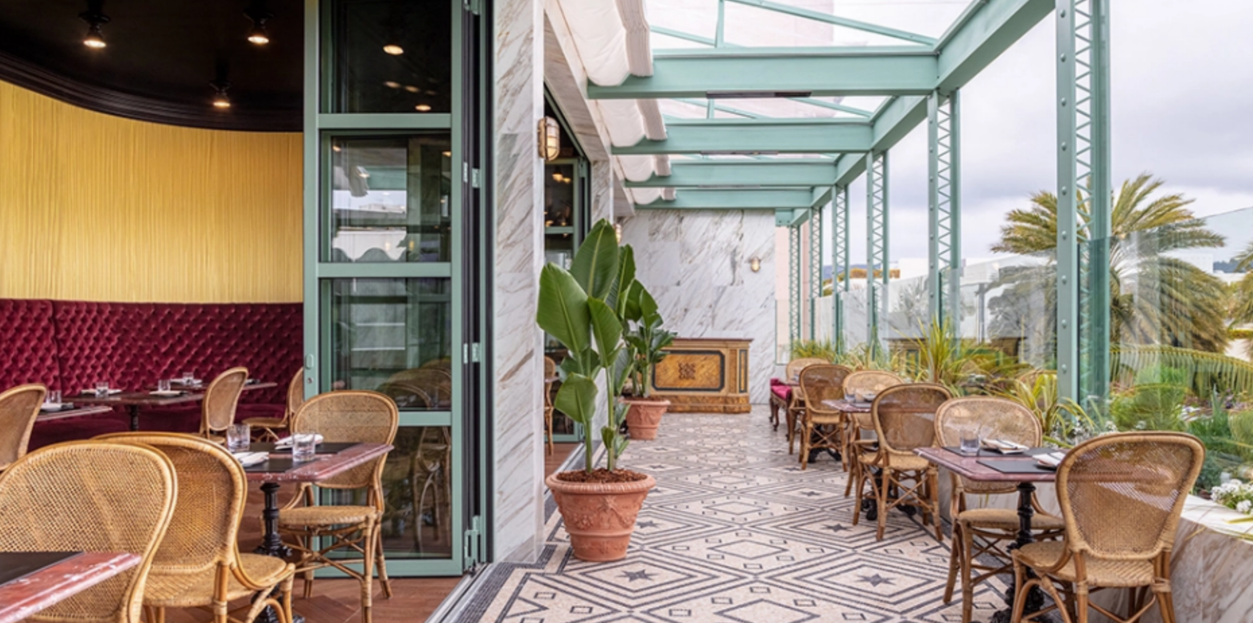
Gucci Osteria da Massimo Bottura.