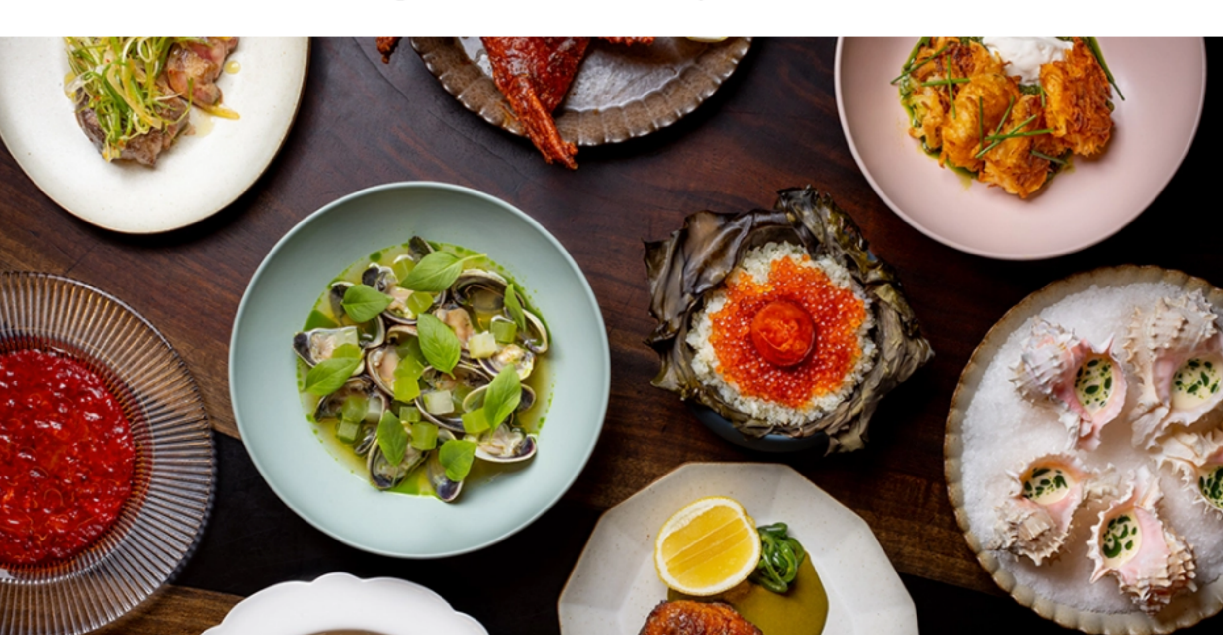
Dishes at Angler Los Angeles.