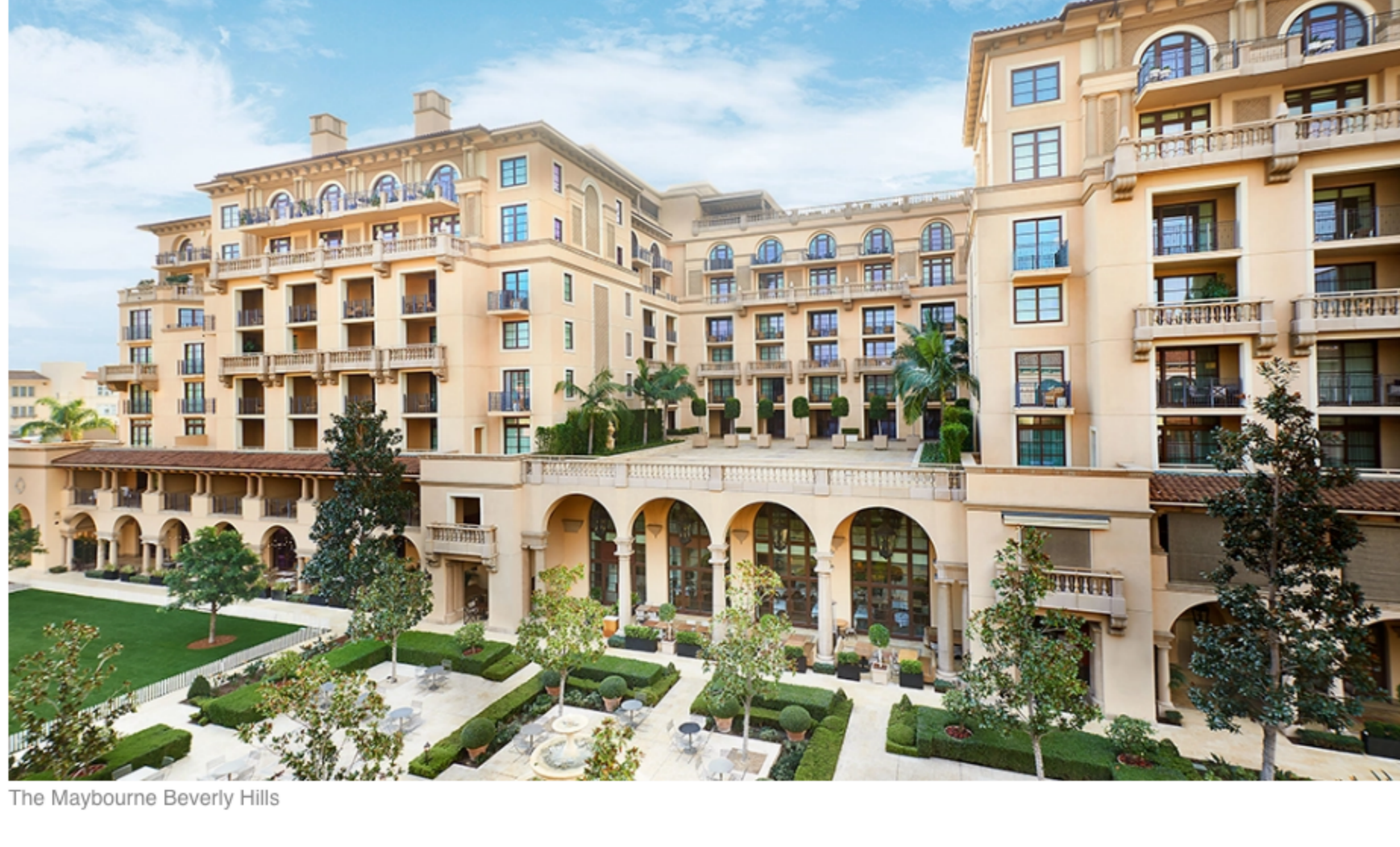
The Maybourne Beverly Hills

The historically posh 90210 has evolved into a lively, modern destination.