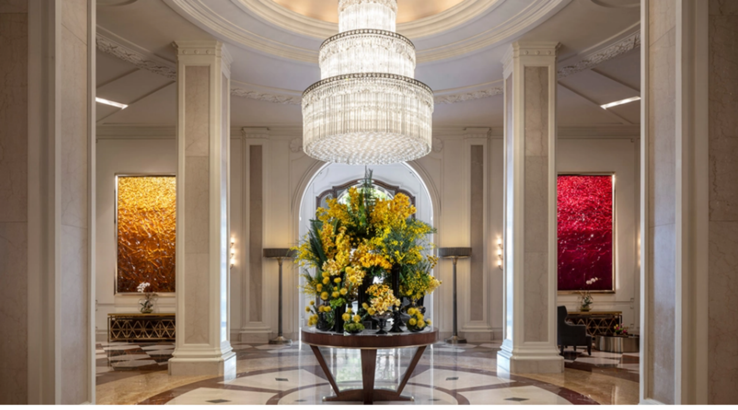
The lobby at the Beverly Wilshire. Beverly Wilshire

Beverly Hills is home to several legendary and luxurious grand dames: The Beverly Hills Hotel , The Peninsula Beverly Hills and L'Ermitage Beverly Hills . Not to mention the Pretty Woman -famous Beverly Wilshire , which first opened in 1928, then later became a Four Seasons in 1992. The hotel's posh rooms were just renovated, providing a fresh California look in grays and silvers that still nods to Old Hollywood. The lobby is still as extravagant as ever, with its massive custom Swarovski crystal chandelier and sleek marble floors. You'll also find shops like Mikimoto and Jason Beverly Hills , along with swanky restaurant BLVD and the flagship location of Cut by Wolfgang Puck . Take a peek at the hallway behind the elevators—which still have the red benches seen in Pretty Woman inside—for a historical timeline of the hotel. Don't forget to book a treatment at the lavish spa, either; we suggest the 90-minute Holistic Detox Body Treatment , which includes a dry brushing, body scrub, body massage and mini facial.