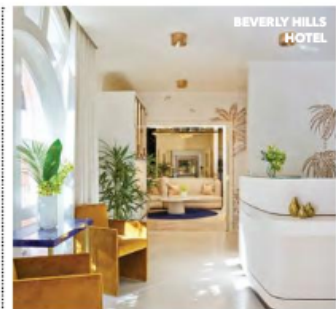
BEVERLY HILLS HOTEL

10:30 a.m. A Walk in the Park → There's nothing quite like seeing the famed Beverly Hills sign in all its glory at the serene Beverly Gardens Park. Snap some scenic shots of the massive palm tree-lined streets and soak up the sun while (actually) smelling the roses. www.beverlyhills.org