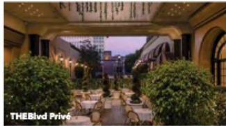
THE Blvd Privé

B everly Hills is a famous community known for its stellar shopping, upscale restaurants and high-profile residents. From fast cars to high-end shops, everyone deserves a taste of the unmatched glitz and glam of the 90210. Being that the array of options and activities in Beverly Hills are endless, we've put together a full 24-hour itinerary to ensure that you get the most out of your visit. Our guide to having the best day in Beverly Hills will have you eating good, looking good and feeling good!