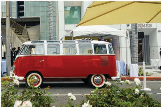
A 1961 Volkswagen Transporter is displayed as part of the Rodeo Drive Concours d'Elegance car show.

The Rodeo Drive Concours d'Elegance car show has taken place annually on Father's Day since 1993. This year, more than 44,000 people headed to blocked-off Rodeo Drive to view some of the world's most exotic cars manufactured by such brands as Bentley, Bugatti, Ferrari, Lamborghini, Rolls-Royce and more.