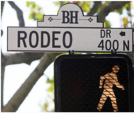
Beverly Hills, UNITED STATES: A Rodeo Drive sign is seen 20 October 2006 in Beverly Hills,... [+]

Celebrities are also helping raise the stakes for stylish F+B around here. This is Beverly Hills, after all. Back in 2021, Rafael Nadal, Cristiano Ronaldo and Pau Gasol teamed up to back the build of Tatel . Specializing in Spanish-inspired flavors, it remains one of the hottest reservations in town. And last summer it was joined by The Hideaway , a hip and inviting space for modern Mexican, stashed away below Rodeo Drive. Ryan Phillippe is a principal investor at the restaurant which features a massive tequila bar, tableside tomahawks and birria, and tiki drinks served in ceramic donkeys. This isn't the Beverly Hills you remember. It's the Beverly Hills you won't want to forget.