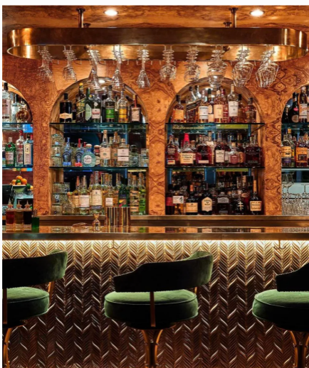
The legendary bar at La Dolce Vita LA DOLCE VITA

Elsewhere about town, an array of recent openings and revamps has everyone in LA buzzing about Beverly Hills. In March the legendary La Dolce Vita reopened. The elevated Italian eatery was once the preferred dining destination of Frank Sinatra, who retains a booth in his honor. Originally opened in 1966, this is the city's ultimate destination for meatballs and martinis.