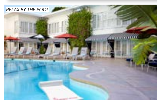
RELAX BY THE POOL