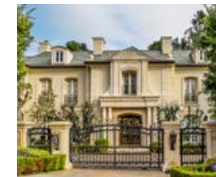
Chinese Theatre and the Hollywood Walk of Fame. INFO: ultimatehollywoodtours.com

Okay, so this tour might not make you feel famous, like the rest of Beverly Hills' offerings, but it sure is the best and fastest way to find celebrity homes and have a quick peek at their properties. Ultimate Hollywood Tours offer a two-hour tour that highlights celebrity homes in Beverly Hills and famous landmarks in Los Angeles. Hear live commentary and get clear views from your seat in the open-air bus as you drive past A-list houses, the Hollywood sign, Rodeo Drive, Grauman's