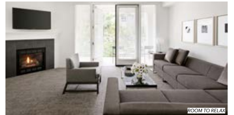
ROOM TO RELAX