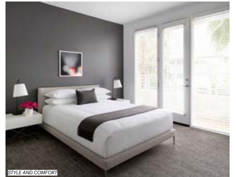
STYLE AND COMFORT

WORDS: ANDRE NEVELING.