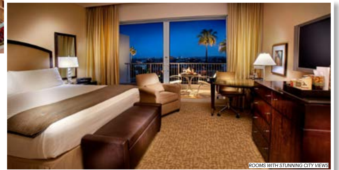
ROOMS WITH STUNNING CITY VIEWS

INFO: For more information and bookings, visit beverlyhilton.com