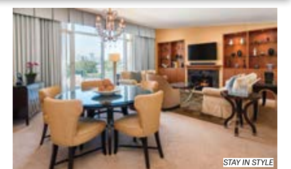
STAY IN STYLE