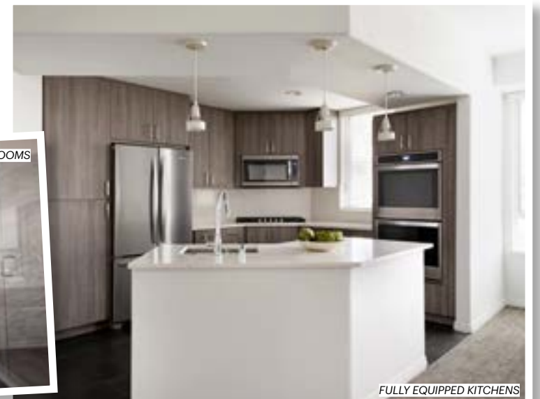
FULLY EQUIPPED KITCHENS